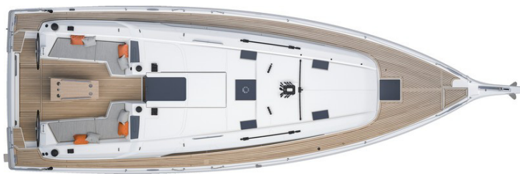
2 cabins 1 head version